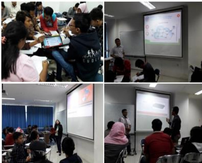
Figure 2. mDPBL teaching and learning environment.

Figure 1 depicts contents various feature of Computer Networks such as concept description and routing algorithm. The description of routing concept includes objective, kind of routing and benefit. While, forward search algorithm as one of the routing algorithm explained of the routing algorithm feature.