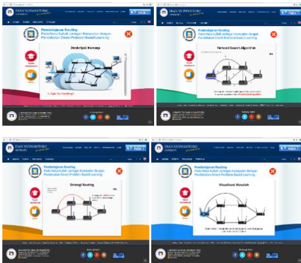
Figure 1. An animation of the Routing process

Figure 1 depicts contents various feature of Computer Networks such as concept description and routing algorithm. The description of routing concept includes objective, kind of routing and benefit. While, forward search algorithm as one of the routing algorithm explained of the routing algorithm feature.