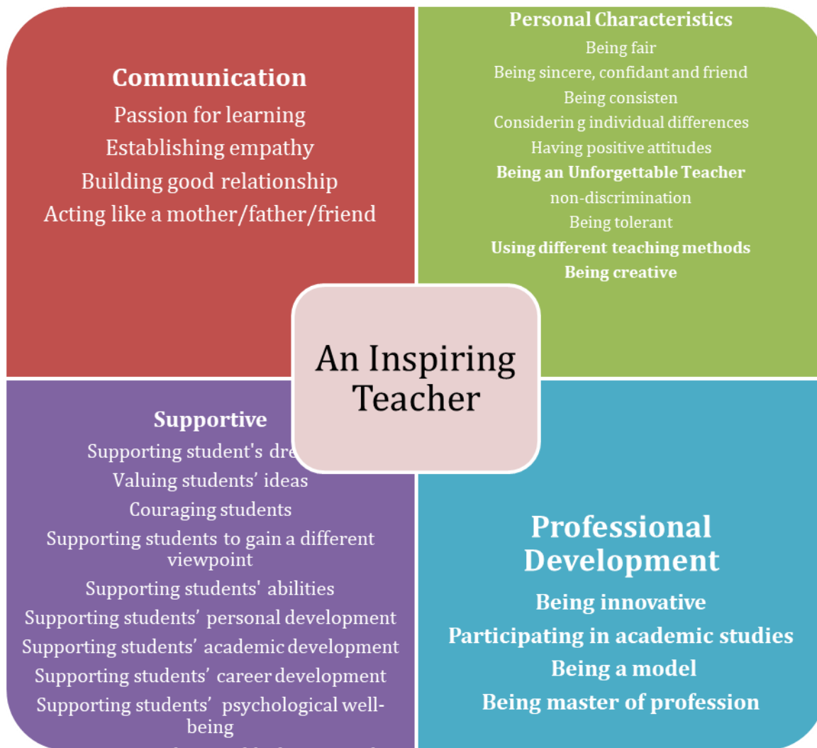
Figure 2. The categories and subcategories of the inspiring teacher

The results of this study demonstrated the characteristics that an inspiring teacher should have according to the opinions of teacher candidates. These findings that are related to the characteristics of an inspiring teacher can be discussed in the light of the related literature. Thus, it is necessary to review the previous studies that focused on characteristics of teacher.