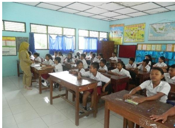
Figure 2. Learning Indonesian in class 5

This research is focused on describing the obstacles in learning Indonesian in grade 5 elementary school. The material in Indonesian becomes less optimal because the teacher in delivering material to students only uses the lecture and storytelling method. Students only listen to explanations from the teacher and do not look active in class, so the learning that takes place is still teacher centered. These findings indicate that the selection of teaching methods by teachers is still not appropriate. This is in line with research conducted by Ixganda and Suwahyo (2015) which states that "the teaching methods of teachers are still not good and not appropriate". This can be seen in the image below: