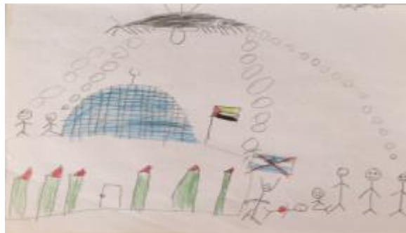
Picture 1. Drawing of the Palestinian refugee child on the theme of war and migration. (C3)

The frequencies of the symbols used in refugee children's drawings with repeating themes children are shown in Table 1 and 2. The analyses of four of the drawings by refugee children are detailed below.