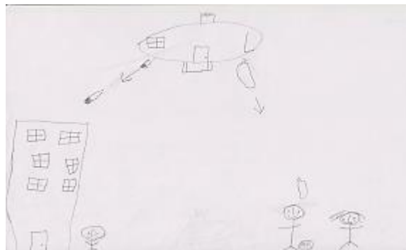
Picture 3. Drawing of the Syrian refugee child on the theme of war and migration. (C11)