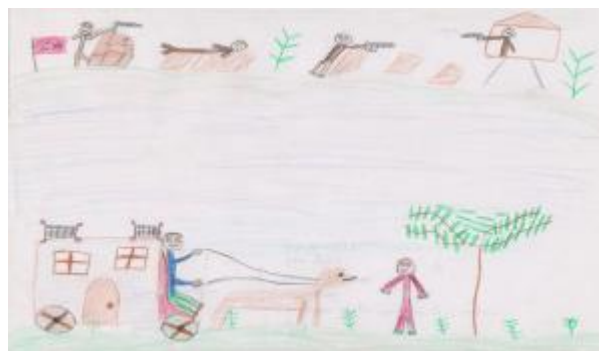
Picture 7. Drawing of the Turkish child on the theme of war and migration. (C39)

In another drawing by a Turkish child, we see both warfare and immigration. There are cars trying to escape from the armed people shooting at them. S/he wants to emphasize the symbols of the immigration following the war. There are no symbols of war in the drawing except for the armed people. S/he also tries to dilute the impact of the symbols by saying, "Their guns don't work because it's raining. Therefore, they cannot fire. So, the cars are able to run away." We see bright colors. As stated before, the warfare and immigration seem to evoke neutral feelings. The sky and ground are separated with colored lines. The elements in the drawing are placed below the baseline, which shows that the child has a sense of belonging to his/her environment. The cars as a symbol of immigration go from left to right. By age 7, children become more aware of time, space, and real life and future becomes more important than the past (Savas, 2014). We can also see trees in different sizes. According to Halmatov (2015), drawing a tree represents the unconsciously drawn self-portrait of the person. Drawing more than one tree may suggest that the child is worried about the existence (pressure) of the others. The trees with cut down trunks and branches give clues for destruction, sense of being lost and negative self-perception. So, the slanted trees, which are called "destroyed" by the child, seem to represent the destruction and losses caused by war.