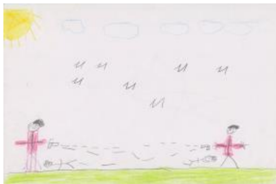
Picture 5. Drawing of the Turkish child on the theme of war and migration. (C29)

The frequencies of the symbols used in refugee children's drawings with repeating themes children are shown in Table 3 and 4. The analysis of four of the drawings by the Turkish children are detailed below.