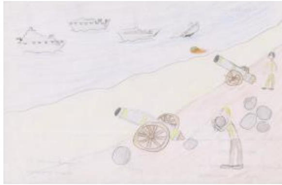
Picture 8. Drawing of the Turkish child on the theme of war and migration. (C43)

In another drawing by a Turkish child, we see relatively faint colors like browns and blues. The dominant use of brown may suggest the need for protection, care and affection while blue is an indicator of tranquility and harmony. Blue may also symbolize being neutral (Savas, 2014) as children tend to use moderate colors when they feel impartial about something. Therefore, it seems that the child remains neutral about war. However, the battleships being sunk by cannon fire are far from the battles of today. The child confirms the historical quality of the symbols by saying that the drawing represents the Gallipoli Campaign taking place between the national forces and the enemy. We see quite a lot of details, including the buttons on the soldiers' uniforms, dropping of anchors and the wheels of the cannon carriages. According to Yavuzer (2000), the drawings by 9-12-year-old children are more detailed and realistic. Here, we see quite detailed figures that look to have better anatomical proportions with clothes on them. Therefore, we can conclude that the child meets the milestones for his or her age.