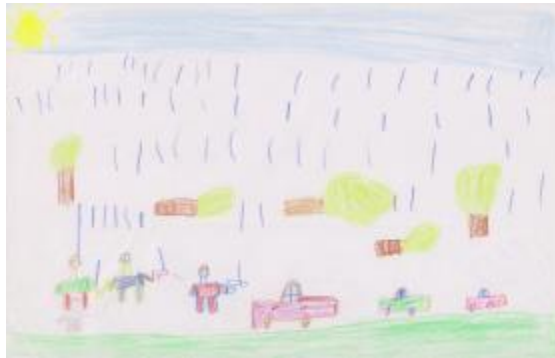
Picture 6. Drawing of the Turkish child on the theme of war and migration. (C34)

When we look at the drawing by a Turkish child, we see more symbols for war rather than immigration. However, when we look closely at it, we do not see any symbols for war except for the armed people shooting at each other. The people shooting guns and the dead people lying on the ground are all smiling. In real life, one cannot see happiness in people's faces in the middle of a battlefield but horror, pain and grief. Therefore, the child seems to use his imagination for the symbols of the war instead of his experiences. We see various bright colors. According to Burkit et al. (2003), children tend to use more colors for the figures they like and moderate colors when they feel neutral about something. Therefore, we can conclude that the child's perceptions of war are rather neutral and far from being negative and dreadful. There is a baseline colored in green, which shows that the child sees herself/himself as a part of the world. We can see natural elements like the sun, clouds and birds. The sun is a symbol of mother. A child cannot exist without his/her mother just like the Earth that cannot exist without the Sun. Sunny weather, clouds with light colors and birds represent happiness and joy of life (Savas, 2014). Therefore, the child seems to have positive feelings and mood (happiness, joy, etc.), which are reflected in his/her drawing.